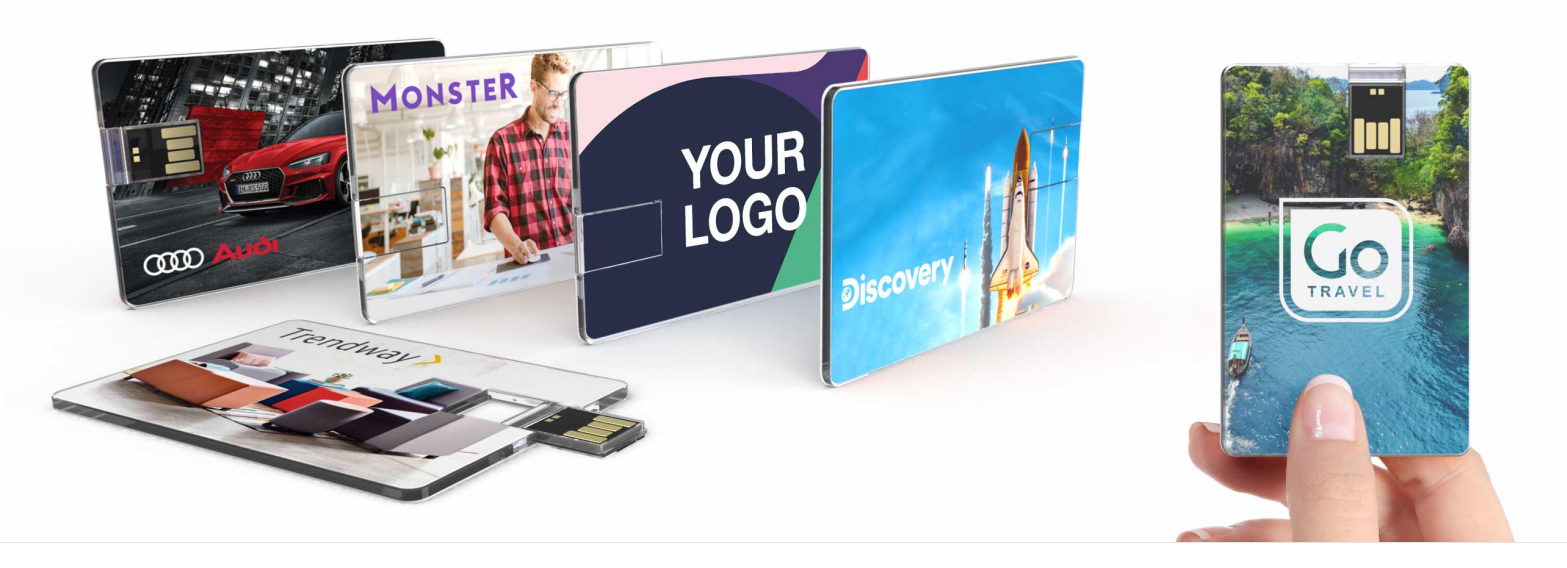
At just 2.2mm thin, the Wafer USB is one of the thinnest USB Cards in the world. It's ideal to store in your wallet, pocket or organizer. Its large brandable area can be photo printed on both sides in full vibrant color to showcase your smartest brand designs.